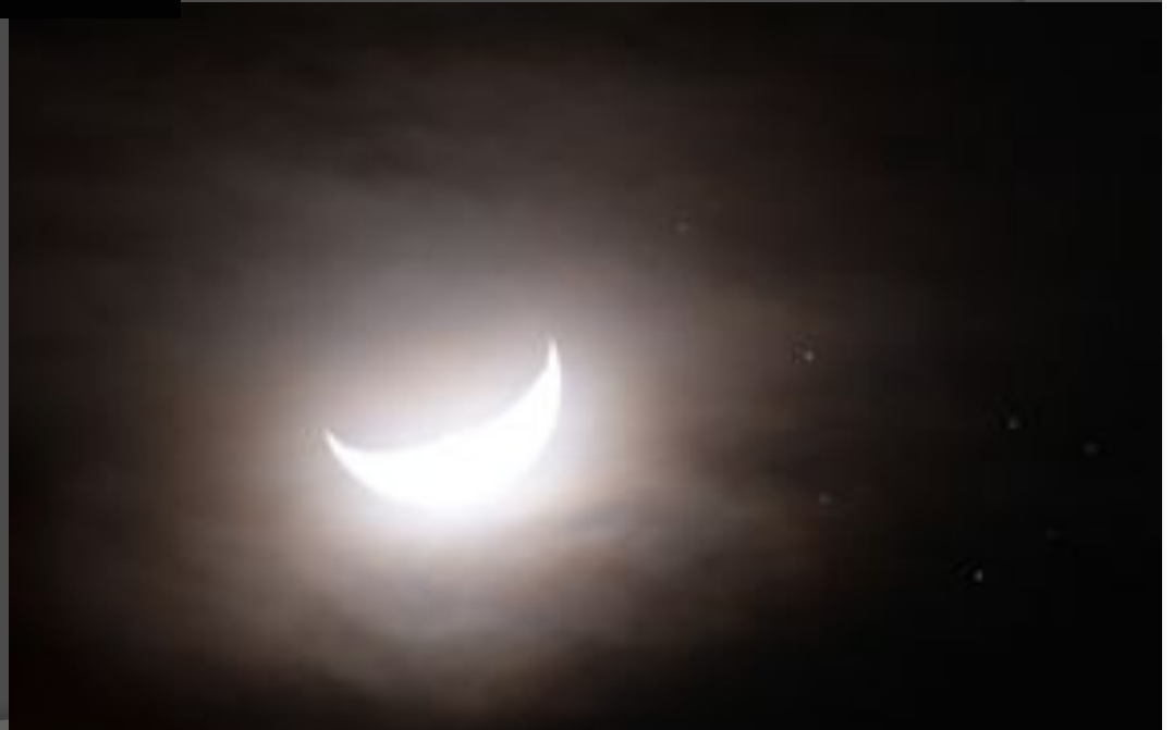
Zoom Lens (300mm) Exp: 1s ISO400 f5.6