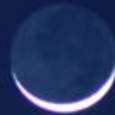
Zoom Lens (300mm) Exp: 4s ISO100 f5.6