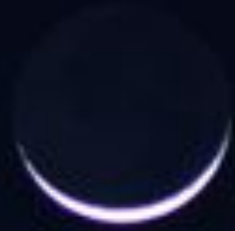
Zoom Lens (300mm) Exp: 1s ISO100 f5.6