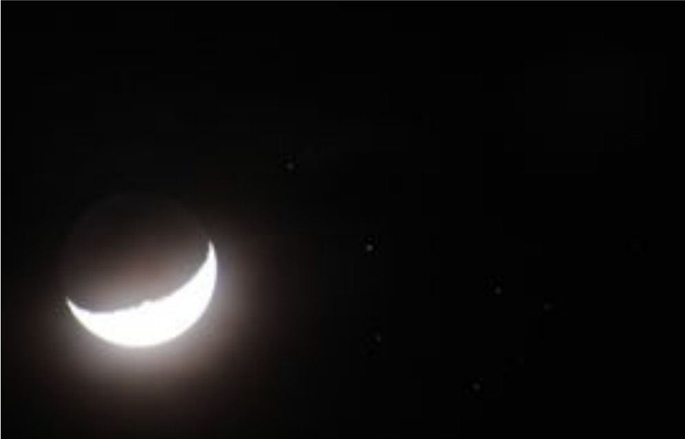
Zoom Lens (300mm) Exp: 1s ISO200 f5.6