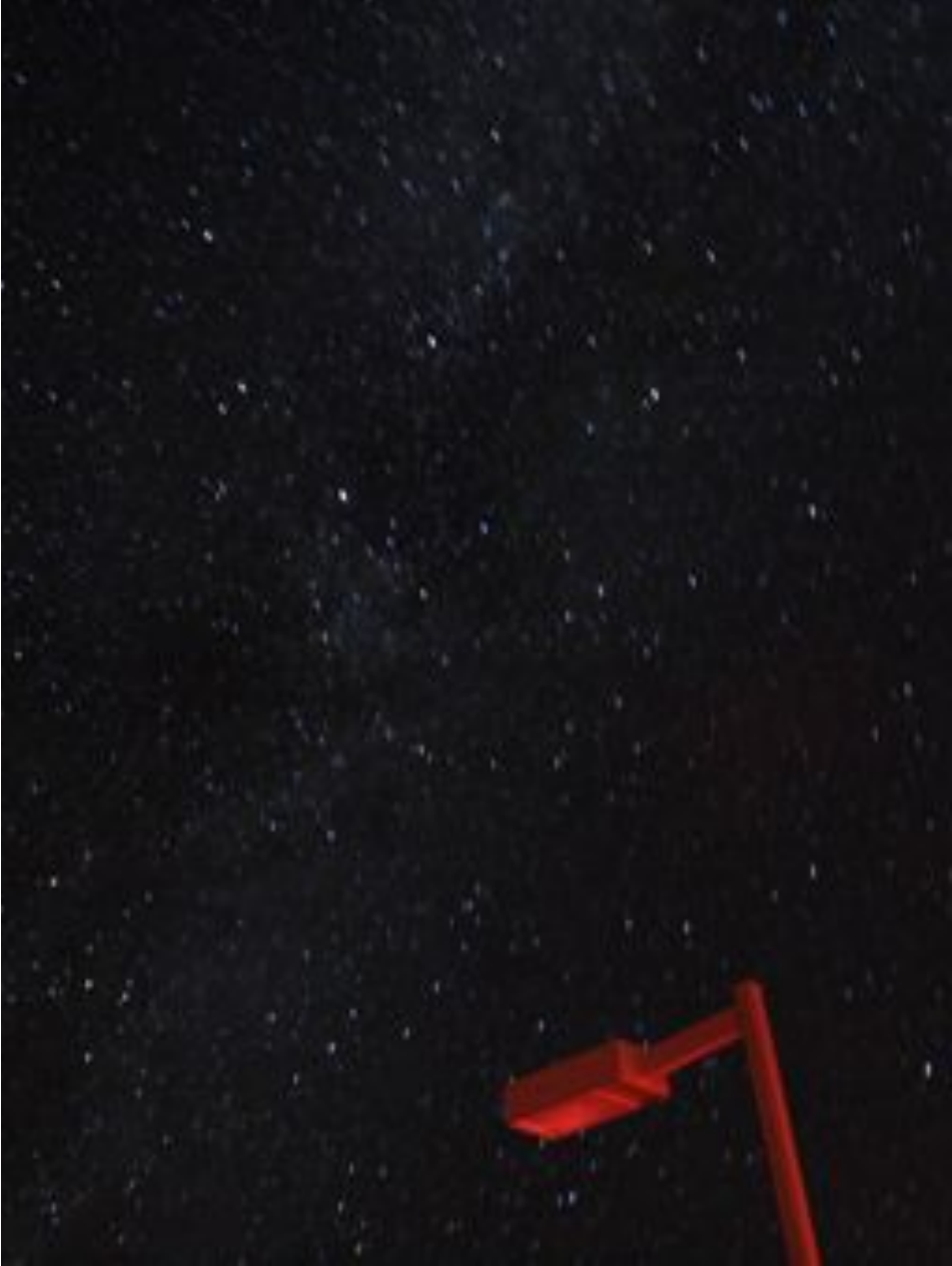
Standard Lens (18mm) Exp: 120s ISO1600 f5.6